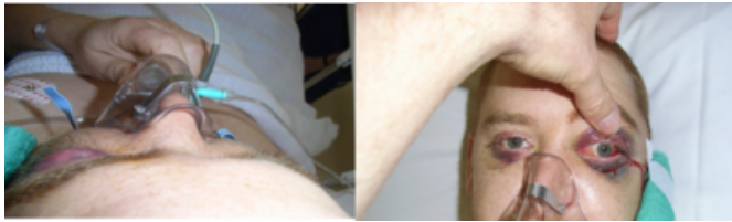
Figure .2. Proptosis (Left); Ophthalmoplegia and chemosis (Right)

A lateral canthotomy was performed by releasing the sutures and incising inferior limb of lateral canthal tendon. After release the ophthalmoplegia resolved and visual acuity improved within minutes.