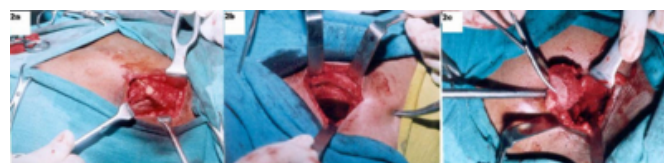
Fig.2- Methods of bone graft harvesting [2a- Outer table of crest exposed and graft harvested, 2b- graft harvested from inner table, 2c- tricortical full thickness graft harvesting]

Various intra-operative parameters like length of incision, amount of graft, blood loss, type of drain used and use of bone wax were noted down to study the comparison of techniques. Visual analogue scale used to assess the degree of the donor site pain, fine touch was tested to evaluate the extent of the cutaneous nerve injury and ultrasonography (n-1) was done detect the bowel herniation through the full thickness tricortical defect in ilium. Patients were followed up for at least 6 months post operative duration and assessed for donor site morbidities. Complications were described to be major or minor as per the definition given by Younger and Chapman.