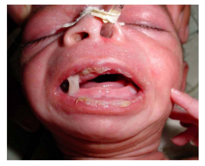
Figure 3: Postoperative photograph showing separation of the Maxilla and mandible with adequate mouth opening.

This gap was maintained by putting two small silastic sheets in the raw molar areas on either side which was secured by few stitches with the surrounding tissues. He tolerated the entire procedure well and returned to the recovery room, breathing spontaneously, well oxygenated. He was shifted back to neonatal ICU and on first postoperative day bottle feeding was started. He could not suck well. Probably because of fusion of the mandible and maxilla he had not developed an active sucking reflex in utero. So a pacifier was used to enhance the development of active sucking reflex (Figure 4).