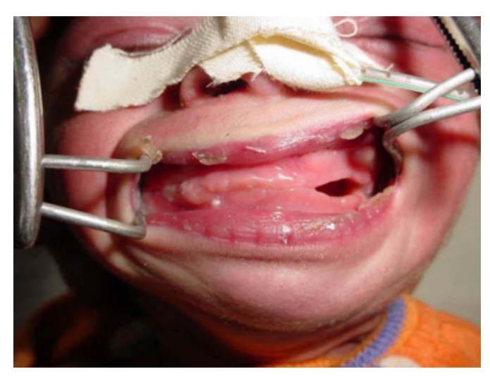
Figure 1: Photograph showing bony fusion between Maxilla and Mandible with a small gap (12mm) in the left canine region.

Very feeble motion was palpable over each