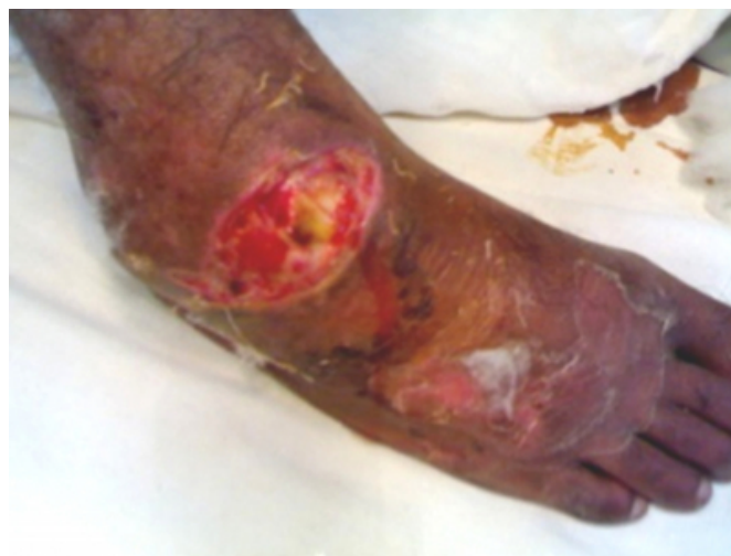
Figure 1: Neglected peritalar dislocation of right ankle with sloughing of skin.

The distal neuro-vascular status was intact. Patient had injured his ankle, when he met an accident while riding a bike. Following accident patient developed swelling and deformity of his ankle. Instead of seeking medical help, the patient felt pray to quackery as such diagnosis and treatment was delayed for more than 8 weeks. Radiographs revealed medial peritalar dislocation (Fig 2a-b). Fig. 2a and 2b AP and Lateral Radiodiographs Showing medial peritalar dislocation.