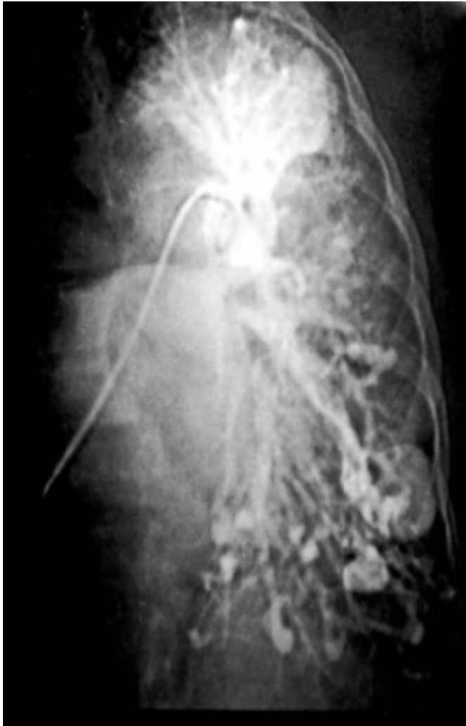
Figure 2: Pulmonary Angiogram on the same patient showing many ovals shaped irregularly sized opacities

Multiple aneurysms of the splenic artery, left occipito-cortical fistula, telangiectasia of hepatic and internal carotid arteries were demonstrated. (Fig 3)