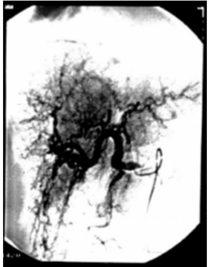
Figure 3: Spleen artery aneurysm seen with radio-paque contrast, in the same patient

All cardiac chambers were normal apart from a slight dilatation of the left atrium. Valve structures were normal. There were no other cardiac anomalies. On color Doppler and contrast study there was a suspicion of aorta-pulmonary or coronary pulmonary fistula.