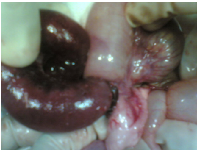
Figure 3: Preoperative photograph showing gangrenous intussuscepted distal ileum

However no lead point was found. Whole gangrenous