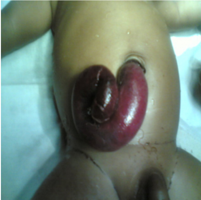
Figure 2: Prolapsed bowel loop at the time of presentation

The baby was prepared for urgent laparotomy under general anesthesia. The abdomen was opened through below umbilicus midline incision. The prolapsed bowel loop was separated from the abdominal wall by fine dissection. The prolapsed bowel loop was intussuscepted distal ileal segment through patent vitellointestinal duct (fig 3). The intussusception was reduced slowly but whole of the distal ileal segment up to ileocaecal junction was found gangrenous.