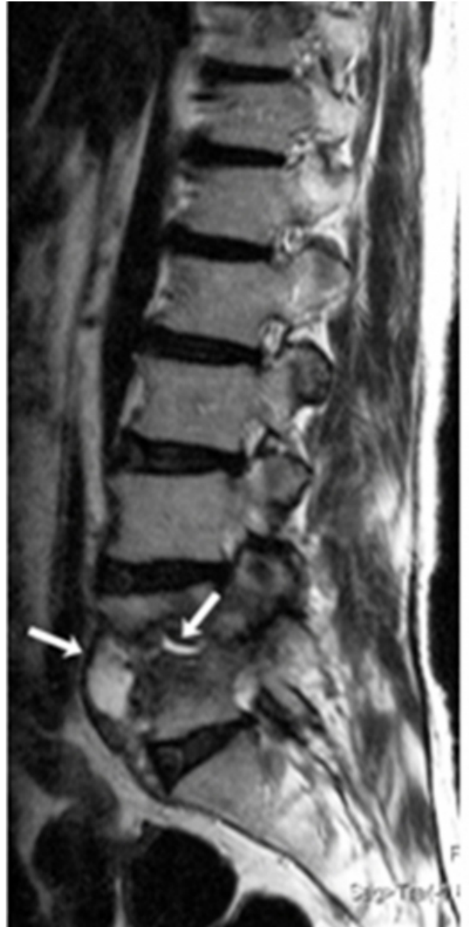
Figure 1b: 65-year-old man with vertebral osteomyelitis due to Mycobacterium avium-intracellulare . Sagittal T2-weighted image obtained at the same level as shows very hyperintense areas in the extended region and in the L4-5 intervertebral disc. ().