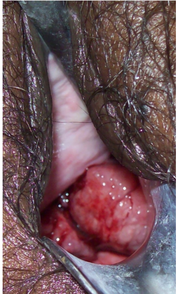
Figure 2: Friable cervical growth as seen on speculum examination.

Rest of the vagina appeared normal. On per-vaginum examination the growth extended from left fornix till the left pelvic walls and there was no downward extension to the vaginal walls. A vague irregular lump could be felt in the pelvis through the right fornix. Nothing else could be made out due to ascites. On per-rectal examination rectal mucosa was free and an irregular growth could be felt extending from left parametrium to the left pelvic wall. A vague irregular lump could be felt in the pelvis on the right side. Uterus could not be made out clearly.