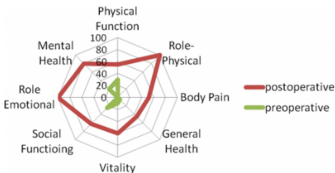
Figure 4: Radar plot comparing preoperative with postoperative QOL component scores (SF-36 scale).