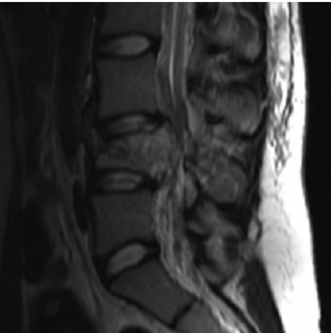
Figure 1: T2 MRI sagittal projection of lumbosacral spine. “Burst fracture” of L4 vertebral body.

Right foot flexion and incontinence was the only neurological deficit preoperatively. Decompressive L4 laminectomy with L3-L5 fixation was performed on the day of injury. However, four years after rehabilitation neurological deficits were not recovered, the main problem for the patient was intractable LBP (VAS 7/10) and in both lower extremities, burning neuropathic pain (VAS 8/10). The quality of life (QOL) was remarkably decreased (SF-36=11), especially with regards to the patients physical health (PCS=9). The psychological examination revealed the patient’s positive expectations for SCS with no signs of depression.