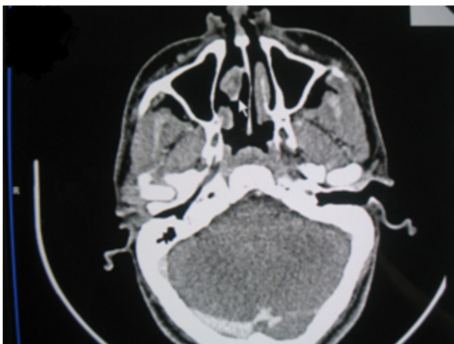
Figure 2: Computerized tomography of the nose and paranasal sinuses reveals a homogenous soft tissue opacity involving the anterior one third of right nasal cavity.

A provisional clinical diagnosis of bleeding polypus septum was made. The mass was excised via the nasal cavity under general anesthesia. It was found to be attached to the anteroinferior part of the cartilaginous septum.