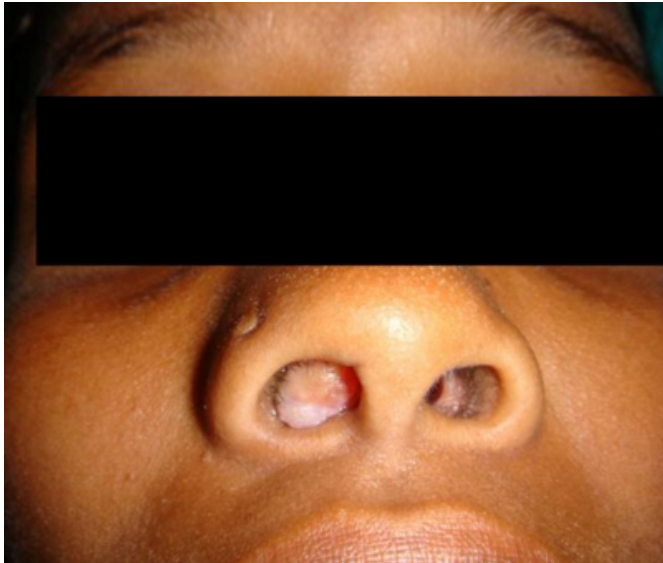
Figure 1: Clinical photograph showing pinkish pedunculated mass in right nasal cavity

There was no cervical adenopathy. Computerized tomography of the nose and paranasal sinuses revealed a contrast enhancing homogenous soft tissue opacity involving the anterior one third of right nasal cavity arising from the cartilaginous septum (Figure 2) without any extension to paranasal sinuses or nasopharynx.