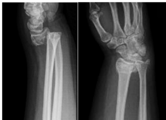
Figure 1 initial radiographs of the right wrist showing displaced off-ended distal radius fracture

A closed reduction in the emergency department was undertaken, with a satisfactory position on post-reduction x-rays. The patient underwent an open reduction and internal fixation 2 days later with a Synthes fixed-angle volar locking plate. The procedure and her recovery were uncomplicated.