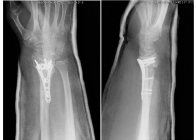
Figure 3 radiographs of the right wrist 5 months following revision with volar locking plate and bone grafting

The patient was again followed up 10 months after the revision surgery. Examination revealed no further tenderness over the fracture site and 40 degrees of wrist flexion and 20 degrees of extension.