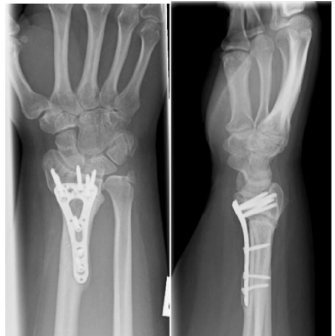
Figure 4 shows radiographs of the right wrist 10 months following revision with volar locking plate and bone grafting