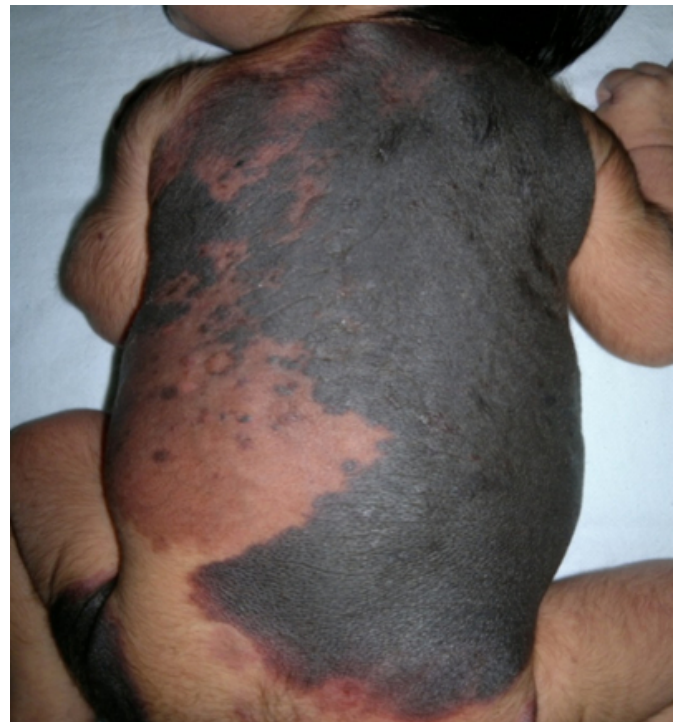
Fig.1 & 2. Congenital Melanocytic Nevi with Satellite Lesions