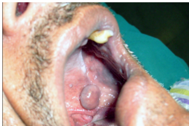
Figure 1: A smooth encapsulated pedunculated mass of 1.5 x 1.0 x 0.8cm arising from left anterior pillar.

Provisional diagnosis of lipoma with epidermoid cyst and hamartoma as other differential diagnosis was made. The routine radiological and blood investigations were normal. After anesthetic fitness the patient was taken up for surgery under local anesthesia. The swelling was excised through trans-oral route. The excised specimen was well encapsulated, yellow colored tumor with a soft consistency measuring 1.5 x 1.0 x 0.8cm. (Figure2).