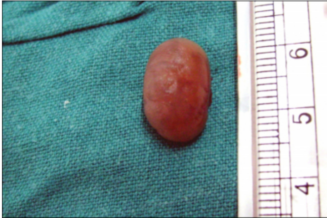
Figure 2: The excised Lipoma measuring 1.5 x 1.0 x 0.8cm.

On cut section, it had typical lobulated lipomatous appearance. Histopathological examination showed uniformly rounded cells with peripheral sheets of mature adipocytes containing large clear cytoplasm and eccentric nuclei with inconspicuous vascularity and no evidence of cellular atypia, confirming the pre-operative diagnosis of lipoma (Figure 3).