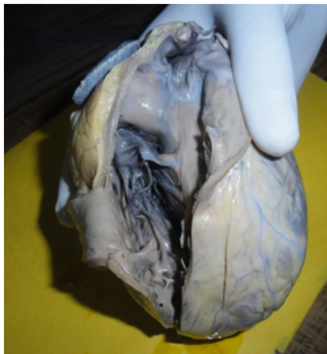
Figure 1 Gross appearance of Heart

Microscopic examination of multiple sections taken from both ventricular walls showed inflammatory infiltrate consisting predominantly of neutrophils with foci of microabscesses and minimal myocyte damage [Figure 2] . Sections from lungs exhibited dense neutrophilic exudates and congestion highlighting the possibility that lungs may be