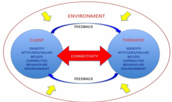
Figure 2. Complex systematic communication processes connect the client, the therapist, and the environment in occupational rehabilitation interaction: an NLP perspective (adapted from Dilts 1998)

The therapist then, as an agent of change and adaptation, assists clients to make mental and physical adjustments through surface structure to deep structure. The therapist applies linguistic and physical methodologies and techniques, through demonstration and communication that drives surface structure function, providing the framework for the client’s sensory adjustment towards change.