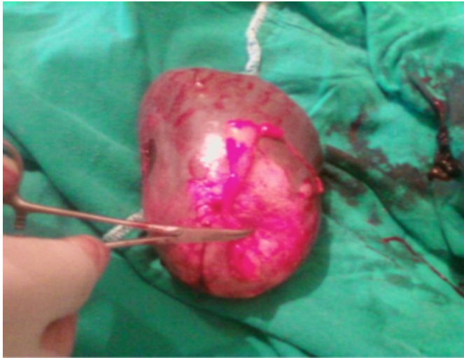
Fig 2: splenectomy specimen showing hydatid cyst upper pole

Postoperative stay in the hospital was uneventful and the patient was discharged on 7 th postoperative day. The patient was in good health at 1, 2 and 3 months of follow up.