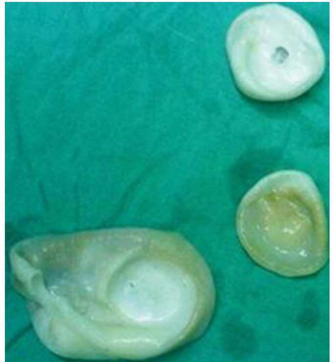
Figure 3: Three daughter hydatid cysts taken from within the main cyst are seen.