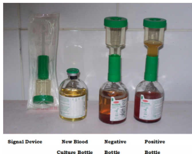
Figure i: Picture of Oxoid Signal Blood Culture System