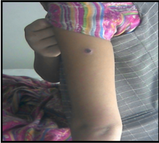
Figure 1: showing a well formed eschar over the left arm.

There was vesicular breath sound on auscultation of chest with air entry decreased on right side. Cardiovascular system and GIT examination was normal. Central nervous system examination was normal except for hearing impairment. On ear examination bilateral tympanic membrane were normal. Hematologic tests revealed hemoglobin, 11g/dl; WBC, 8800/mm 3 and platelets, 1.8 lakh/mm 3 . Differential leucocytes count showed neutrophilia. Weil Felix test showed antibody titer against OX K >320. Elisa was positive for scrub typhus antigen. Blood test for typhoid, malaria, and dengue were negative. Renal function tests, liver function tests and serum electrolytes were normal. Chest x-ray showed right lower lung homogenous opacity. Rinne's test was positive in both ear in 256, 512, 1024 Hz frequencies respectively and Weber's test was not lateralized. On pure tone audiometry examination there was bilateral moderately severe sensorineural hearing loss. The hearing threshold level in left ear is 48dB and 52 dB in right ear for air as well as bone conduction. On brainstem evoked response audiometry there was significant prolongation of wave III and wave V latency and inter-peak latency of wave I-III and wave I-V (fig 2). Patient was treated with doxycycline and on follow up after 2 months patient hearing was almost normal. Only puretone audiometry examination was done which showed normal hearing threshold in speech frequencies with hearing loss persistent in higher frequencies.