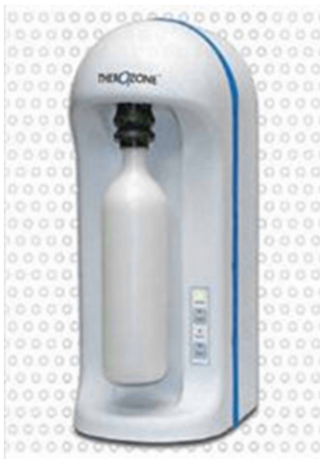
Figure 3: TherOzone Unit