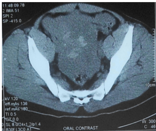
Fig. 2: CECT of the abdomen showing haemoperitoneum with the hypodense mass on the left