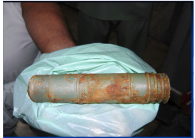
Figure 5: Cylindrical handle of a broom removed from the sigmoid colon (second case)