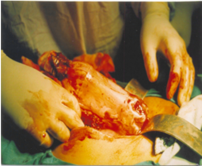
Figure 4: The plastic bottle eased out of the sigmoid colon with patience.