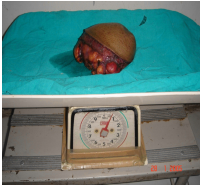
Fig. 6: Excised specimen