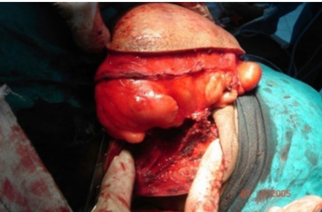
Fig. 5: Intraoperative image (excision)