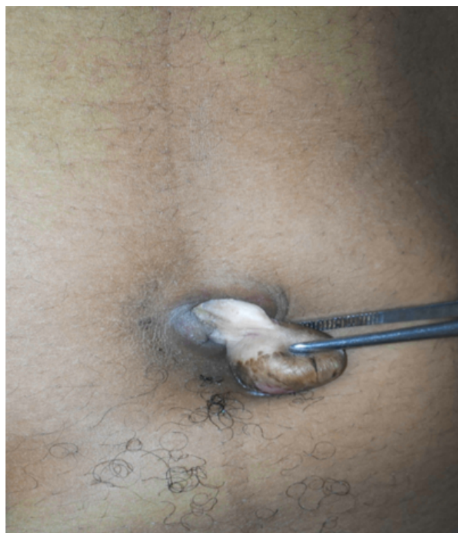
Figure 1: Umbilical polyp with underlying stalk attached to the umbilicus