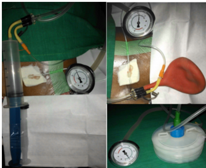
Figure 2: Measurement of negative pressure with suction gauge with syringe type, romovac and mucus sucker. The 50 cc syringe piston is held in position with a 20 cc syringe piston.

A standard 50cc syringe is able to create a maximum amount of 450 mm hg pressure. A standard romovac drain is able to create a negative pressure of 75 mm hg pressure and a mucus sucker produces a vacuum of similar amount. We have used infant feeding tube, ryle's tube and suction catheters as suction tubing's with good efficacy and these materials are readily available in government hospitals.