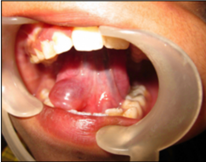
Figure: 1 Pre operative photograph

Aspiration biopsy yielded thick, viscous fluid and histopathological examination (HPE) revealed it to be mucous. Based on the aspiration & clinical findings the swelling was provisionally diagnosed as ranula. Other hematological and biochemical investigations including Complete Blood Count (CBC), Erythrocyte Sedimentation Rate (ESR) were all within normal limits. Chest x-ray was normal. After routine preoperative investigations, as the size of the cyst was small (< 2 cm) and it was superficial in nature, a conservative approach of marsupialization of ranula was planned. Local anaesthesia was given. The marking of the cystic swelling of the ranula was done by tacking the edges of the cyst to adjacent surrounding mucosa with resorbable suture, followed by de-roofing of the cystic lesion. The cavity which resulted from marsupialization was packed with betadine gauze (10% povidine –iodine topical antiseptic solution) and the pack size was gradually cut short as per the obliteration of the defect. The patient had an uneventful postoperative course and fully recovered. A tissue was sent to HPE for confirmation. HPE report confirmed the specimen to be ranula (Figure 2a, 2b,2c,2d). The case was followed up for 18 months at bimonthly interval. There is no reoccurrence of the lesion (Figure 3). Patient is still under follow up.