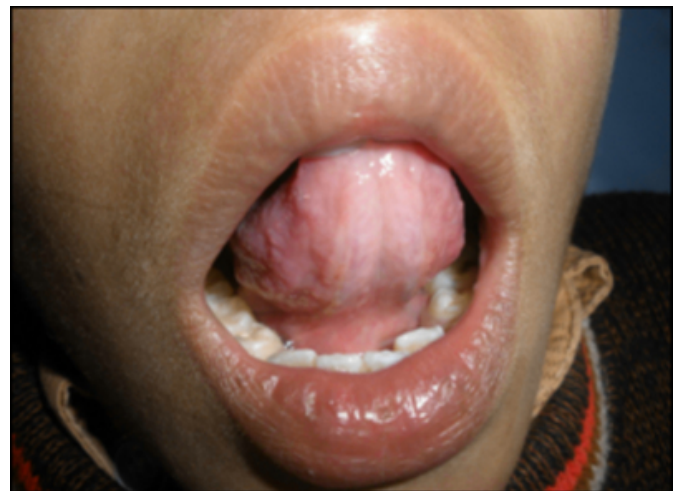
Figure 3: Post operative follow up of 18 months