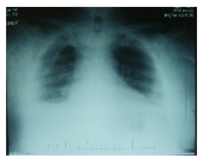
Figure 2: clearing of reexpansion pulmonary edema in the right lung