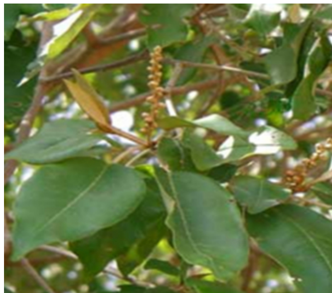
Figure 1: The leaves of