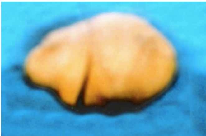
Figure 3: Specimen of stone after removal

Urgent surgical removal of the stone was planned because of