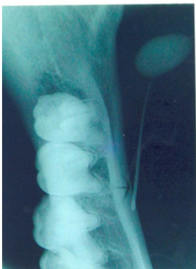
Fig.4- Occlusal radiograph revealing the presence of submandibular sialolith with gutta percha almost approaching the sialolith

After the radiographic examination a final diagnosis of sialo-oral fistula of the right submandibular gland was made.