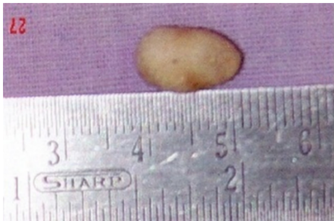
Fig.5- Sialolith measuring 1cm in diameter

It was sent for biochemical examination which revealed the presence of calcium, phosphorus and oxalate. Patient reported back after one month with no obvious complaint, except for the scar in the sutured area.