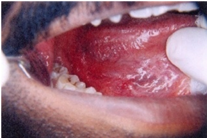
Fig.2- Right posterior lingual aspect of floor of mouth relation to 3 molar, showing the linear cleft

The area was mildly tender. On stimulation, no salivary flow was evident from the submandibular duct. On bimanual palpation of the superficial lobe of the right submandibular gland a small nodule like material was palpable roughly measuring about 0.5 cm in diameter. Keeping the chief complaint, history, and the clinical picture in mind a provisional diagnosis of right submandibular sialolith\ salivary fistula was made.