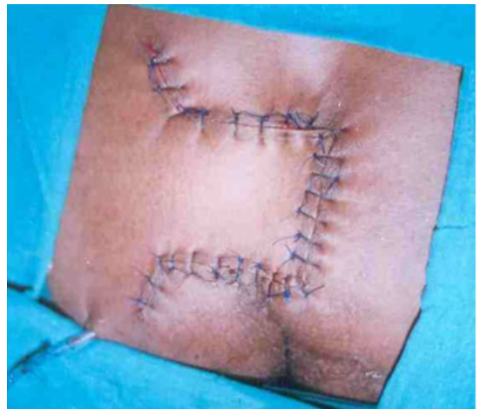
Figure 4: Showing final closure with eccentric suture line

Postoperative management included low residue diet for 3 days to avoid passage of stools and mobility was restricted for 48 hours. Supine position was preferred because the added compression was helpful in decreasing dead space and promoting flap adherence. Drain was not removed before 5 th postoperative day even if the drain output was <10 ml/24 hour, because the vacuum created by negative suction drain helps in adhering the flap to postsacral fascia. Patients were discharged on 5 th /6 th postoperative day after drain removal