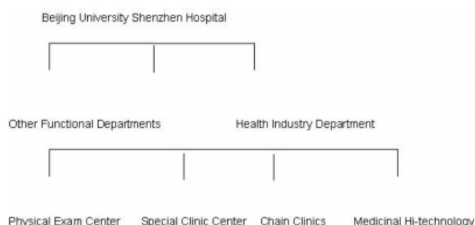
Figure 2: Structural organizations of Peking University Hospital health industry