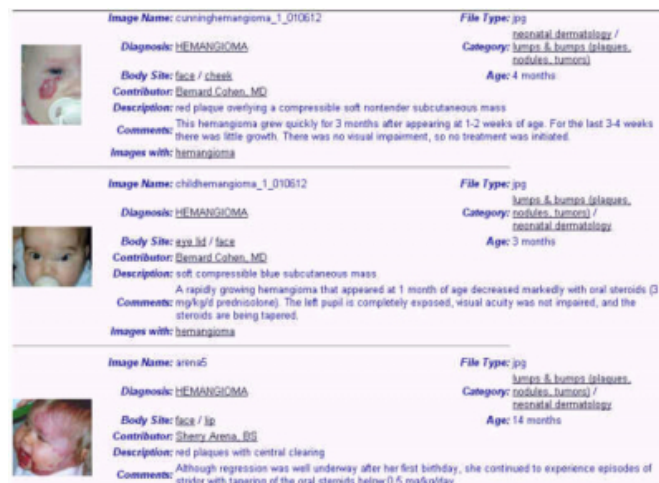
Figure 2: Partial results of a search for "Hemangioma";

Currently the Dermatlas contains more than 2100 images, 645 diagnosis and 58 categories and continues to grow rapidly. An average of 700 visitors come to the site every day (Figure 3) with the majority (75%) of visitors originating from locations in North America. Since its online debut in December 2000, more than 300,000 searches of the image database have been performed. The most commonly used keywords for image retrieval include eczema, hemangioma, scabies, psoriasis, measles, impetigo, acne, atopic dermatitis, varicella, kawasaki, rubella and herpes. We are able to record and monitor all user searches, which allows us to identify specific user interests and to add images to Dermatlas based on relevance to our users.