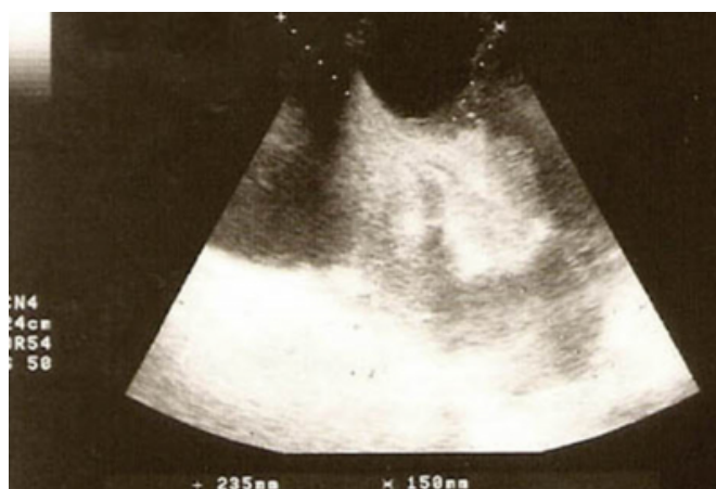
Figure 1: USG of left lumbar region showing a cystic mass replacing the whole of left kidney with an echogenic focus at the center.

The CECT of the abdomen and pelvis revealed a hypodense lesion of 5.3 x 4.2cm at the inferomedial aspect of the left kidney with non-functioning left kidney. The patient was operated through midline incision and a large multiloculated kidney filled with pus was found. There was a mass at the medial and inferior portion of the kidney. This had compressed the ureter leading to hydronephrosis which later got infected forming pyonephrosis. Total nephrectomy (Fig 2) was done and tissue was sent for histopathology.