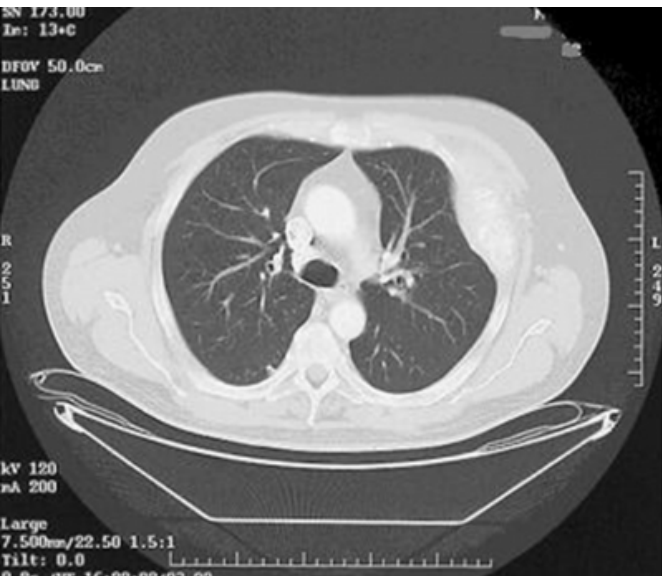
Figure 3: CT Chest. Sclerotic mass involving the anterior 4 and 5 ribs of left thoracic wall

A bone scan showed multiple bony metastases throughout the ribs, the thoracic and lumbar spine.