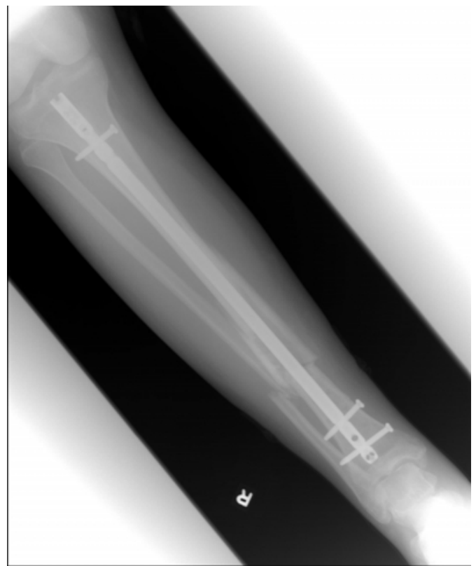
Figure 2B: Post-operative AP view demonstrating new bone healing and good alignment.