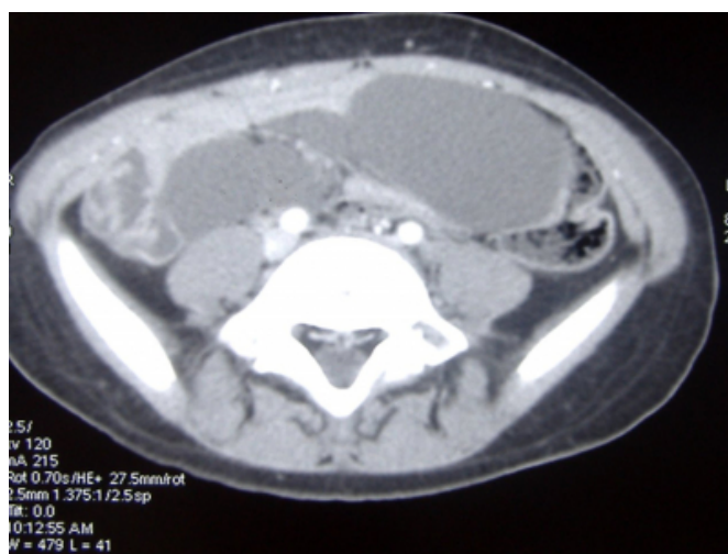
Figure 1: CT scan showing intra-abdominal cystic lymphangioma with attenuation values in the range of water.

Exploratory laparotomy revealed cysts in the mesentery of the jejunum without adhesions to adjacent bowel. The cystic mass contained clear yellow fluid (Fig. 2); enlarged lymph nodes were found (Fig 3). The rest of the abdomen was normal and without free intraabdominal fluid. The mass was resected. The postoperative course was unremarkable.