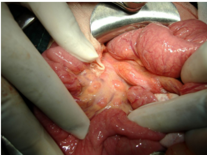
Figure 3: Enlarged mesenteric lymph nodes.

At microscopical pathological examination, the cyst wall showed attenuated endothelial lining positive for CD 31, smooth muscle fibers, and fibrovascular adipose tissue. Lymphocytic aggregates were seen throughout the cyst wall, with diffuse chronic inflammatory infiltration below the endothelial lining. Based on these findings, the final diagnosis of mesenteric cystic lymphangioma was made. At 6 and 24 months follow-up, our patient was completely asymptomatic and ultrasonography and CT showed no evidence of recurrence.