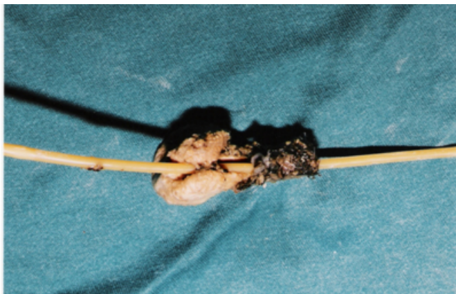
Figure 2: Petrified urethral stent with ring shape.

The migrated urolume with stone were removed by open suprapubic approach.