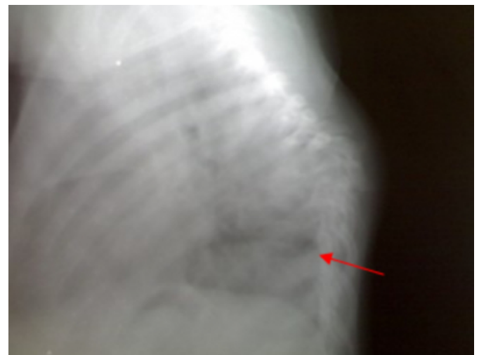
Figure 1: LATERAL VIEW OF COLLAPSED T9 – T11