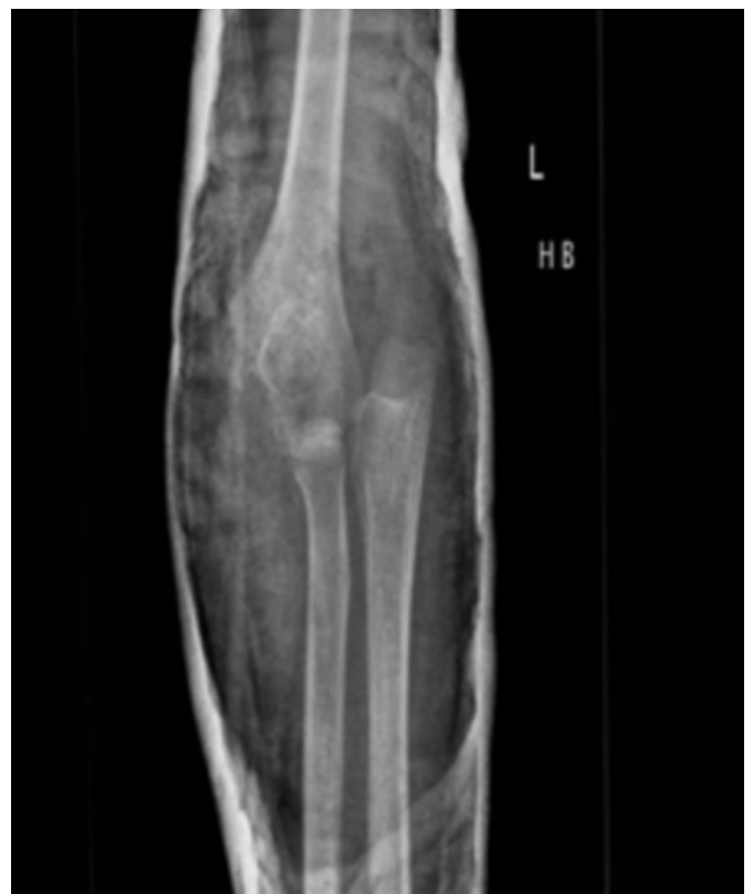
Figure 2b: AP pre-op

Intraoperative radiographic screening revealed a transepiphyseal fracture without a dislocation of the elbow,