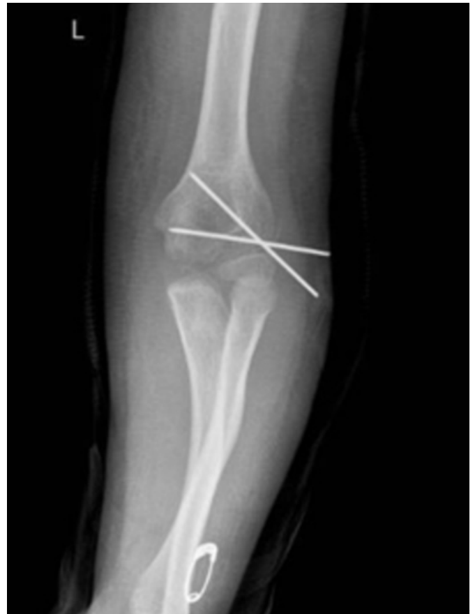
Figure 3a: AP after fixation