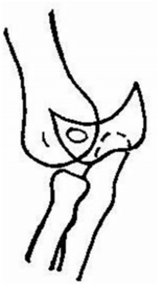
Figure 2c: Schematic diagram

The fracture was treated by open reduction and internal fixation with Kirschner wires (figs 3a & b). The fracture united and the wires were removed at six weeks.