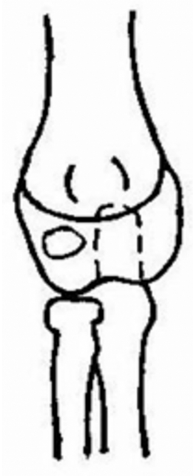
Figure 1: Normal elbow