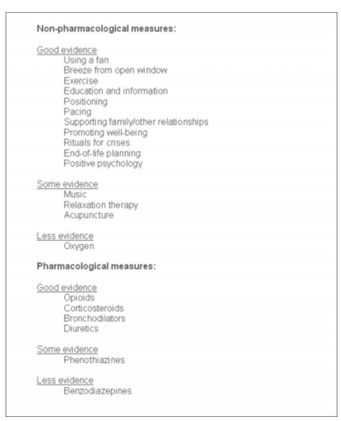
Table 4: Treatment of intractable breathlessness in palliative care (, , )