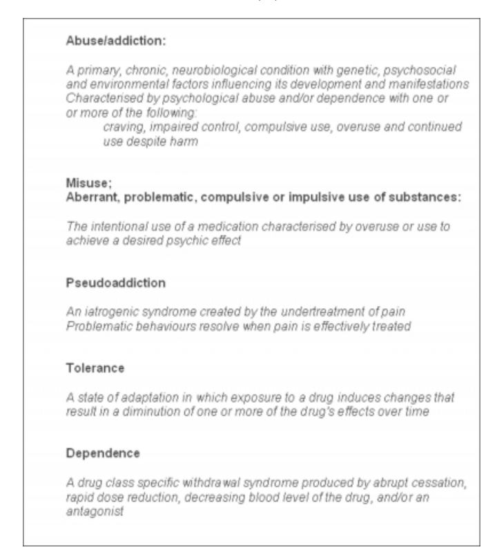
Table 1: Clarification of terms (,, )