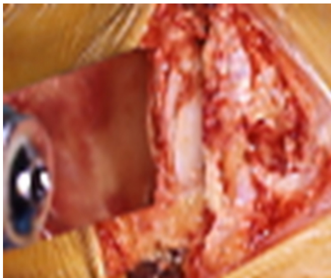
Photo III : chopart's osteotomy of correction

In the talo naviculaires arthrodesis, we filled the resection space 18 times with a graft in order to maintain the length of the first ray