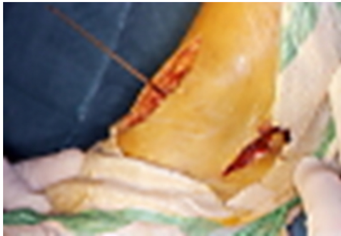
Photo II : chopart's double Extension by internal and external access with fixing of location

The radiographic location by pin/ on the line space of Chopart is necessary because of the local modifications of the talo navicular articulation/joint. In fact, the naviculo cuneiforme joint/articulation is the only one that possesses most common features with the talo navicular joint.