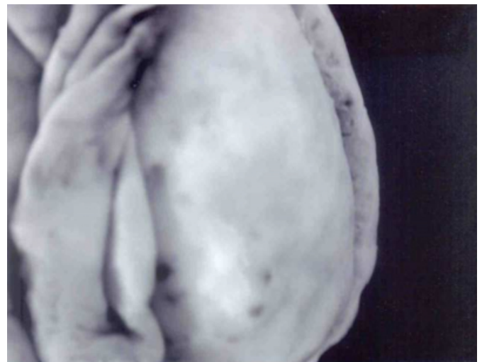
Figure 1: Gross photograph showing nodular external surface of the testis.

Left testis measured 4 x 2.5 cm and was unremarkable externally as well as on cut section. On histological examination, the right testis showed atrophy of the testicular parenchyma and presence of areas of well to moderately differentiated adenocarcinoma in the interstitium (Fig.2 & 3). Histological examination of left testis showed atrophied parenchyma but no metastatic tumor deposits were identified.