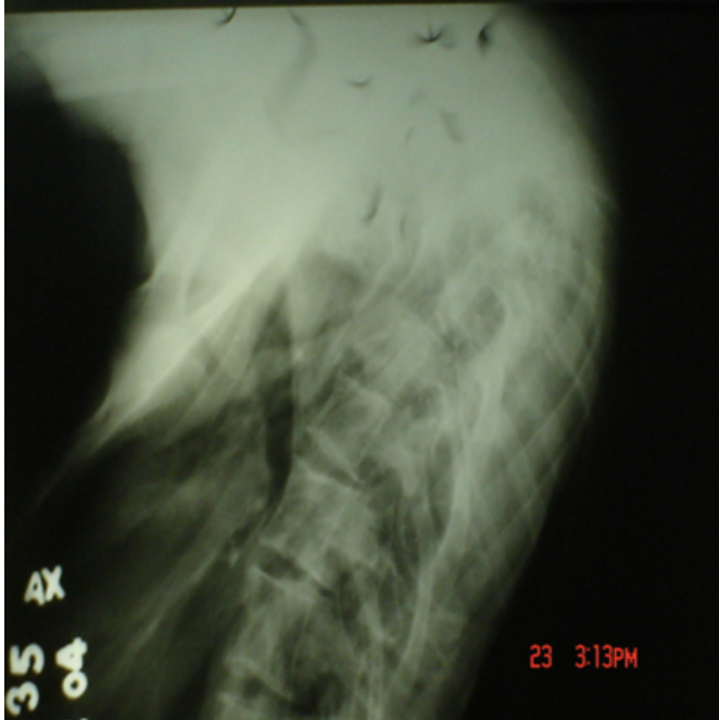
Figure 3: Lateral radiographs showed a severe kyphotic (100 degree) in Dorsal spine (D4-9). Since the disease and deformity occurred during the growing period, and the absence of normal stress on the vertebral column, the part of spine distal to the deformity has vertebra

The only operative procedure that has been claimed to prevent increase of kyphotic deformity is the radical excision and bone grafting performed in Hong Kong by the pioneers of the radical operation by themselves 13,14 . At present scenario, young children having thoracic lesions with involvement of 3 or more vertebra, recumbency in prone position in early active stage, and operative debridement (anteriorly), if the disease is not healing by drugs, and bone grafting (posteriorly) for panvertebral stabilization may minimize the development of progressive kyphotic deformity 22,23 .