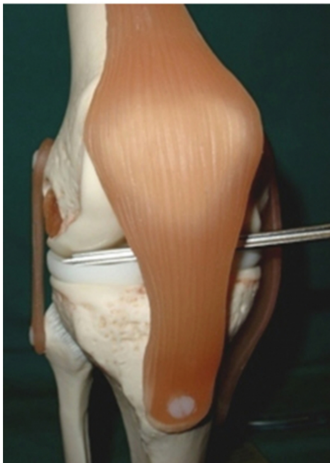
Figure 1a: Model reconstruction of arthroscopic repair without guards

The meniscus staple gun was then introduced through the cavity of the endotracheal tube till it touched the meniscus. [Figure – 1(a), 1(b) ] After adequate positioning, the trigger was pulled to allow good approximation of two edges.