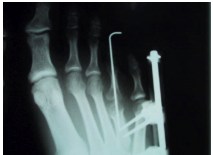
Figure 3: Radiograph right foot showing distraction site, K-wire and external fixator in situ

Post-operative radiographs obtained during the first week of distraction revealed the K-wire in the left foot was not accurately placed across the MTP joint. The K-wire was removed. Partial weight bearing with crutches was allowed immediately after surgery. Broad spectrum antibiotics were required for pin tract infection. Distraction of the right fourth metatarsal was stopped after the metatarsal length of 18mm was achieved and this was after thirty six days. The external fixator was left in place for another 59 days until complete bone union had occurred. The amount of lengthening was approximately 32.8% of the original length and the Healing Index 94:1.8cm (Fig IV). The Healing Index is defined as the ratio between the healing time in days and the lengthening achieved in centimeters. The range of motion of the MTP joint was slightly decreased at follow-up but the patient was satisfied with the results. He returned to wearing regular shoes 4 weeks following the removal of the fixator and was pain free in the right foot (Fig V).