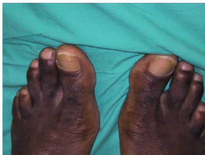
Figure 1: Pre-operative photograph both feet