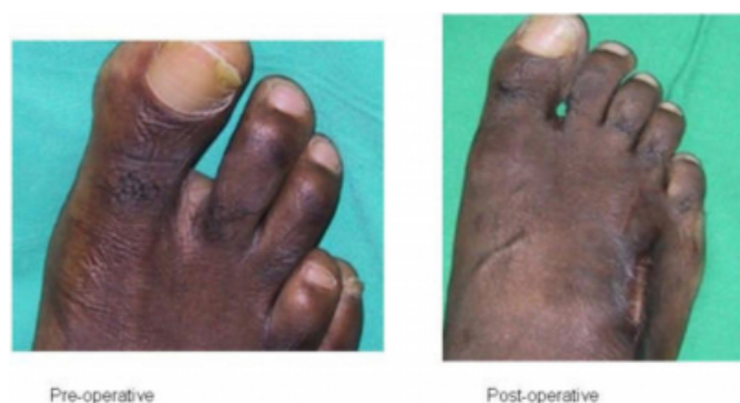
Figure 5: Photographs of right foot Pre and Post operative for comparison

Distraction of the left fourth metatarsal was discontinued after twenty days due to medial and plantar angulation of the metatarsal. The desired length was also not achieved. The patient declined further surgery until the right foot was fully functional.