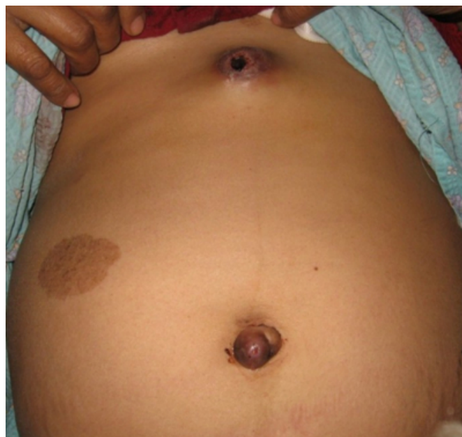
Fig1 photograph of patient showing skin and umbilical metastasis