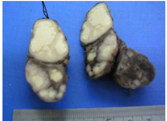
Figure 2: Macroscopic view of the lesion, creamy yellow necrotic fields