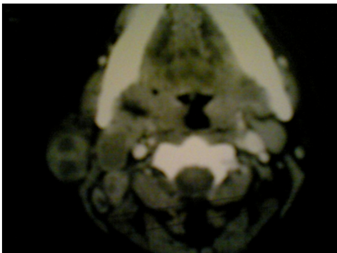
Figure 1: CT scan of the patient