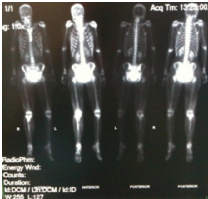
Figure 6: Bone scan images showing increased tracer activity in the proximal right tibial metaphysis. Note this patient was unable to empty her bladder before the scan.

This patient subsequently had surgical debridement of the right proximal tibia which yielded 100ml of frank pus. Five holes were drilled on the antero-lateral side of proximal tibia and a wound drain was left in situ for 48 hours. Culture and sensitivity results of the purulent specimen and bone tissue were identical to that found in blood earlier. After another two washouts in the following week, this patient made an excellent recovery with resolution of symptoms and steady improvement in inflammatory marker levels. She received six weeks of intravenous vancomycin after surgical debridement followed by two months of oral clindamycin as per advice from the infectious diseases physicians. Follow up at six weeks post-debridement showed that this patient had made a full recovery and normalisation of all inflammatory markers.