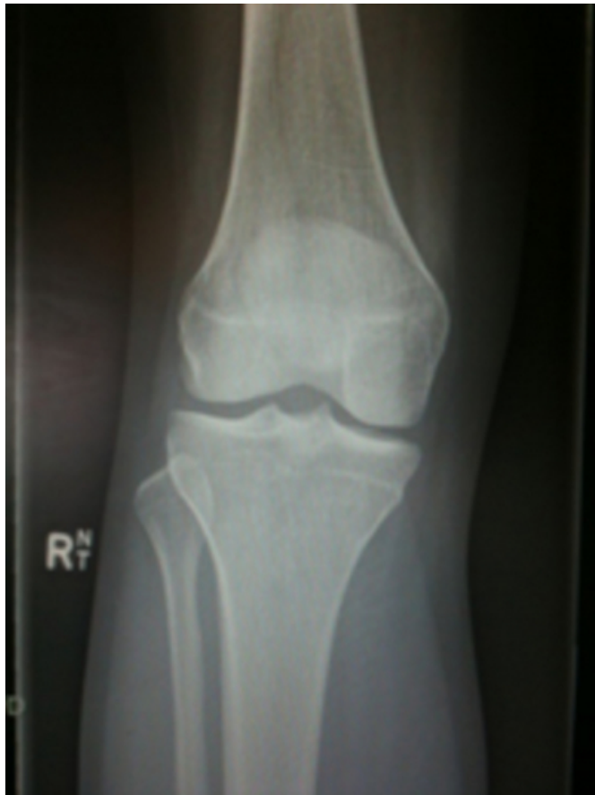
Figure 1: Plan radiograph of right knee joint

A knee joint aspiration was performed and initial gram stain revealed no crystals, low white cells ( 540 \times 10^6/L ) and no organisms. Although her white cell count in blood was normal, her erythrocyte sedimentation rate (ESR) and C-reactive protein (CRP) levels were elevated to 74mm/hr and 91mg/L respectively.