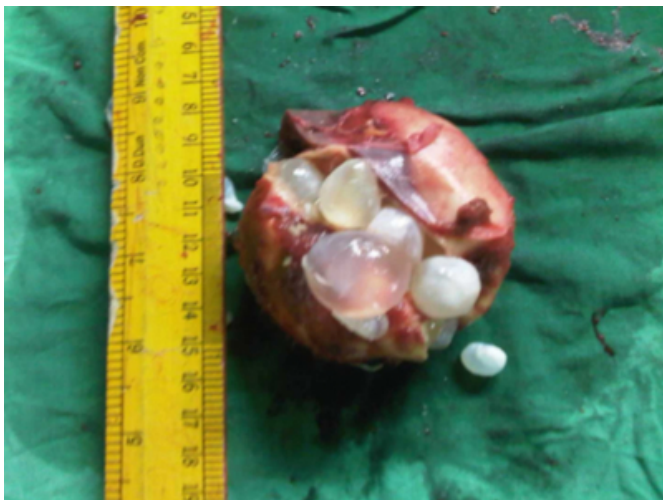
Figure 3. Specimen cut open showing daughter cysts typical of hydatid disease